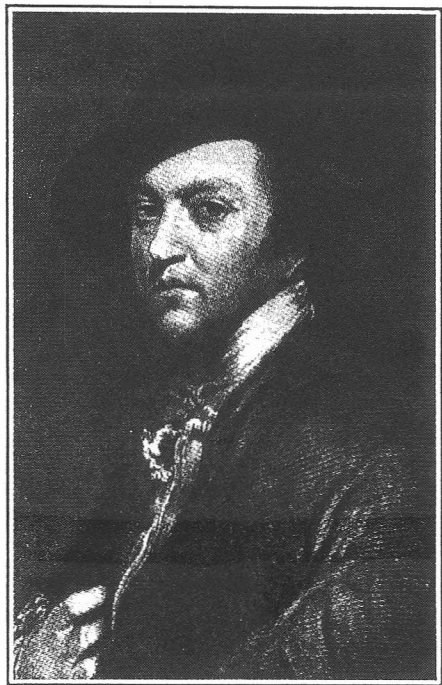
SIR JOSHUA REYNOLDS Celebrated English Painter